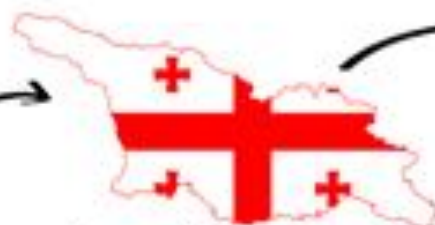
Brave Kids Georgia (22 July- 31 July 2018)

After the Final Performance all kids traveled back home