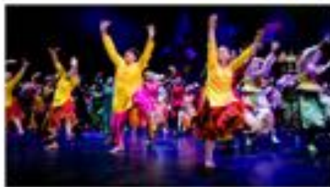
BRAVE KIDS GRAND FINALE !!!

On 8 July all kids traveled together with their leaders and artistic instructors to Wrocław to present the Brave Kids Grand Finale Show at Centennial Hall