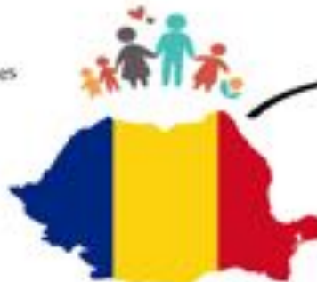
Brave Kids Romania (16 August - 26 August 2018)

After the Final Performance all kids traveled back home